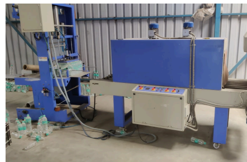
SHRINK WRAPPING MACHINE