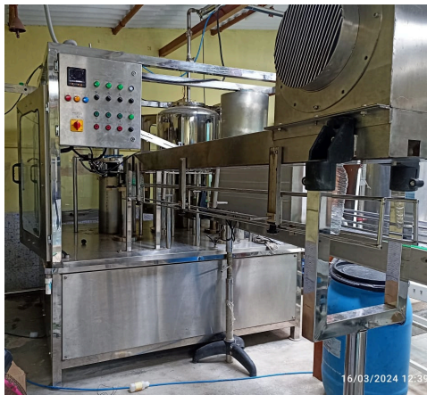
PET BOTTLE FILLING