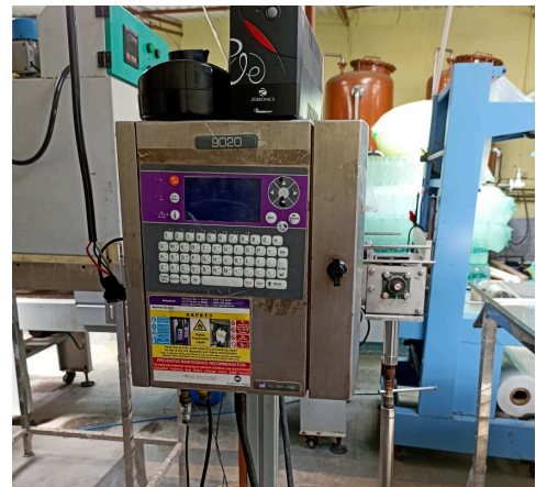
BATCH COADING MACHINE